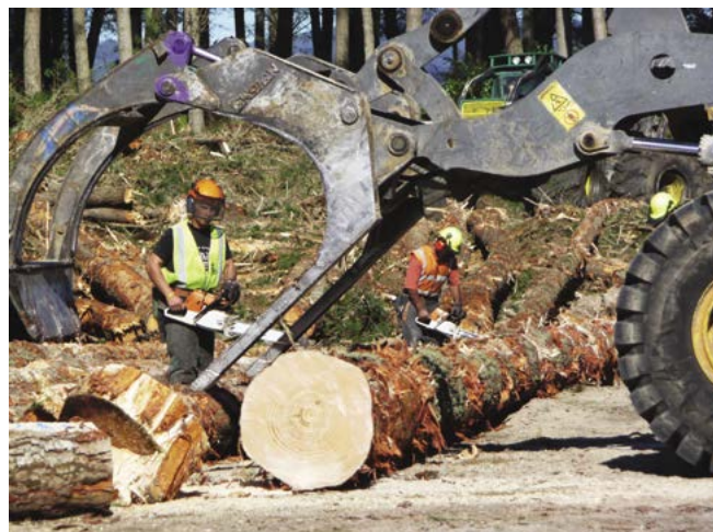
Landowners working in harvesting gang

annual cashflow. This reliable income forms a useful basis from which to plan and facilitate an investment strategy from which iwi members can expect to start seeing meaningful returns within acceptable time horizons. A move from landlord to forest owner will, in the short and medium term at least, compromise this.