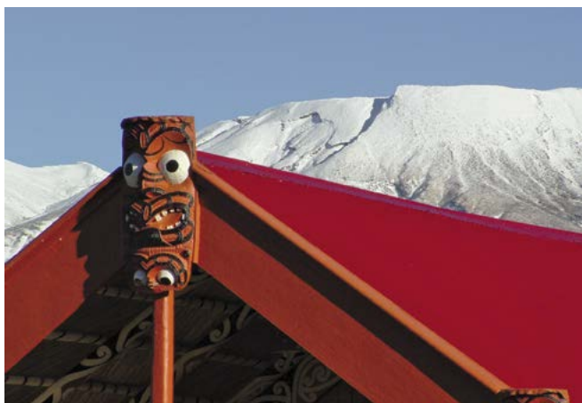
The Tuwharetoa Forest Trusts now provide marae grants

in these areas are limited. This in turn directly threatens the sustainability of these communities, and getting even a few people into reliable work can make a significant difference.