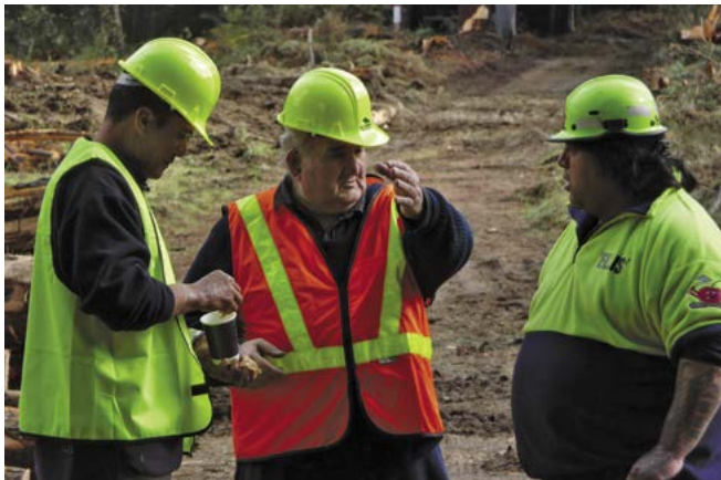
Forest trustees discuss operations with contractor

The potential for Māori to grow their share of both plantation land and tree ownership is sometimes held up as a beacon of hope for increasing domestic involvement in the industry. From a national perspective greater Māori involvement in the industry would probably be beneficial. Māori permanence on and deep connections with their lands are consistent with the long time horizons required for forestry, and the bulk of any profits generated are likely to stay in New Zealand. For Māori too it could lead to long-term benefits. In addition to any financial returns, it would help sustain their connection with their lands, generating employment and supporting the rural communities in which many prefer to live.