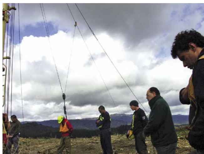
Karakia at the start of a new harvesting operation

Considerable areas of Māori-owned land do not present an attractive forestry investment – being limited by terrain, fertility, location and/or altitude. This includes some Crown forest lands returned under Treaty claim, many of which were established foremost for environmental and land stabilisation purposes. In these situations the landowners may have difficulty in attracting a lessee, even at very low rental levels, while investing themselves will in effect lock them into a low-return investment.