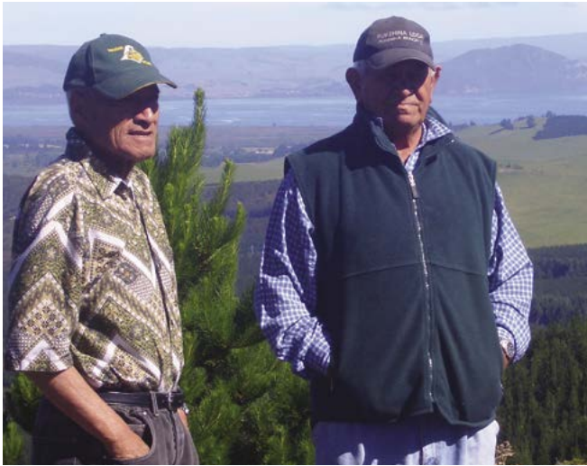
Kaumatua inspect their land and forest

sufficient for a landowner to afford only a 50 to 80 per cent share of the subsequent rotation. If the land offers a reasonable forest investment it is likely that a co-investor can be found, although they may prefer at least a 50 per cent stake in the business. This therefore will not give the Māori landowner the control they may have sought as one of the primary reasons to invest in the first place, and will then require a 60-year commitment (two rotations) before they start receiving the full harvest income from their lands.