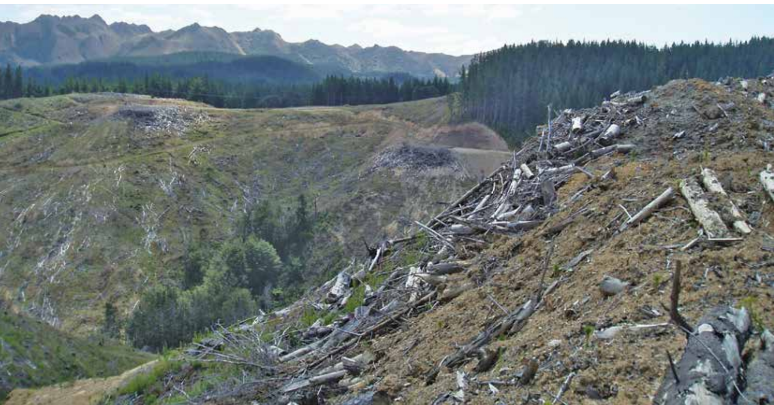
Example of hauler logging harvest residue distribution with most of the debris located around skid sites