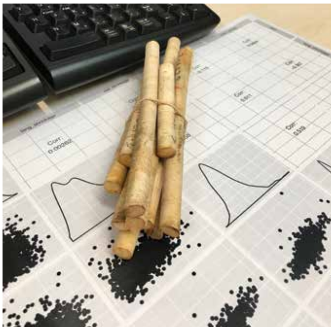
Radiata pine increment cores are used to evaluate acoustic velocity, density and shrinkage properties

National Institute of Water and Atmospheric Research (NIWA), soil data from Landcare Research, and digital elevation models (DEMs) provided by participants. DEMs are typically derived from LiDAR scans of landscapes. The first step is to determine how best to localise estimates of climate, which NIWA provides on a 5 x 5 km grid (called the Virtual Climate Station Network or VCSN) across New Zealand. Then localised climate estimates are included, with the best available soil and topographical data, to run a model that estimates potential photosynthetic