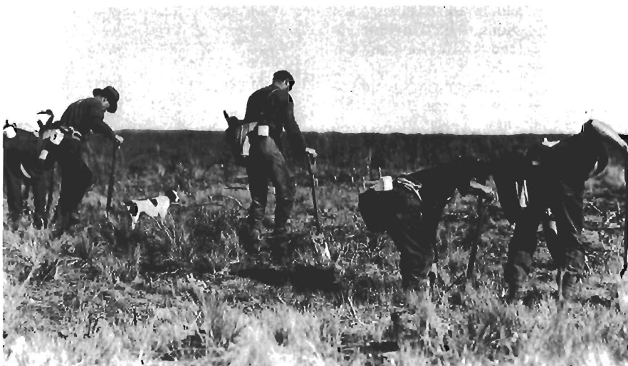
The planting at Kaingaroa, 1923.

The concept was not the European one where land must pay and the owner makes a living from his forest. Industry thrives on this basis and is even rap-