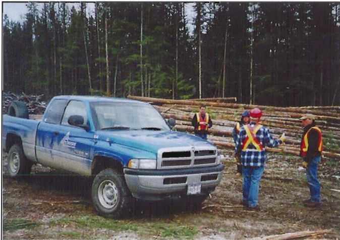
Lincoln students at a Riverside Forest Products logging operation in Armstrong, B.C.