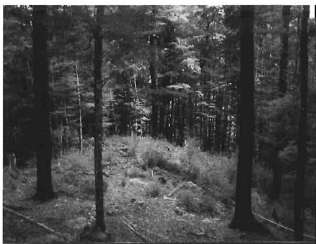
Figure 1 : Vigorous regrowth of mixed beech forest in a small (0.05 ha) harvested coupe at Glenhope Forest, Nelson. Selective thinning of this regeneration has potential to significantly improve sustainable timber production.

Some long-term silvicultural trials in naturally regenerated beech in Westland (red beech, Nothofagus fusca ) and Southland (silver beech, N. menziesii ) have shown considerable promise of enhanced diameter growth in response to periodic thinning. Three decades after commencing thinning of beech forest regeneration the mean tree diameter of plots thinned heavily to 150 stems per hectare was twice the diameter of unthinned controls for both red and silver beech. The positive implications of such a response for timber production prospects from natural beech forest, when under intensive management by continuous-cover systems that maintain near-natural stand structure and composition, are tentatively discussed.